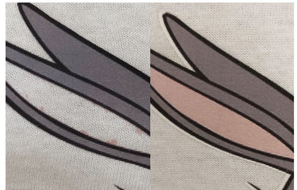
The pink did not transfer because it is too light.

If you must use pastels colors or light gray scale values, varied fill patterns such as marble may work better than solid fills.